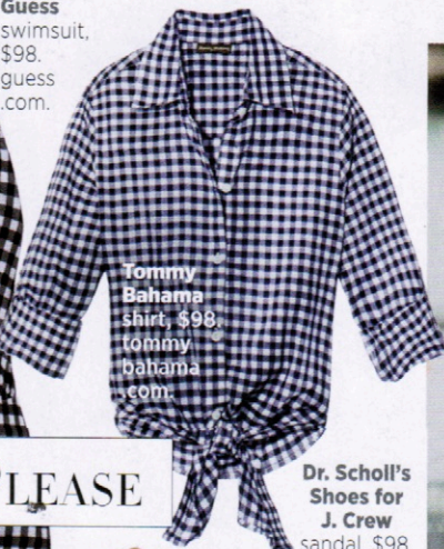
Tommy Bahama shirt, $98. tommybahama.com.