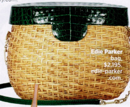
Edie Parker bag, $2,195. edie-parker.com.