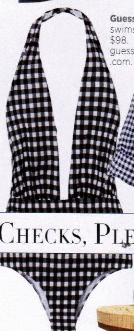
Guess swimsuit, $98. guess.com.