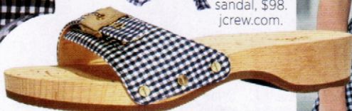
Dr. Scholl's Shoes for J. Crew sandal, $98. jcrew.com.

SQUARED AWAY Update your closet staples in gingham, a timeless pattern for the beach and beyond.