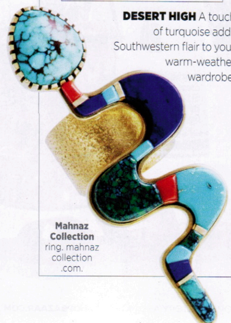
Mahnaz Collection ring. mahnazcollection.com.

DESERT HIGH A touch of turquoise adds Southwestern flair to your warm-weather wardrobe.