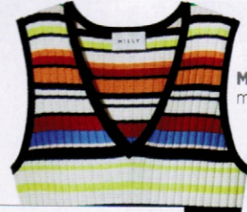
Milly dress, $370. milly.com.