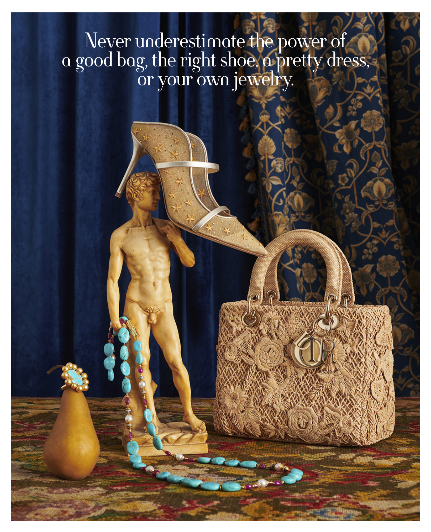
MALONE SOULIERS X L'ATELIER NAWBAR MULES ($850); DIOR HANDBAG; VERDURA NECKLACE ($19,500); ASSAEL RING ($17,000). OPPOSITE: ALEXANDER MCQUEEN DRESS ($3,590); MIZUKI EAR CUFF ($750) AND EARRINGS ($2,300); MUNNU THE GEM PALACE NECKLACE, BROOCH, AND RING; BUCCELLATI NECKLACE ($33,000) AND BRACELET ($24,500); CHANEL WATCH