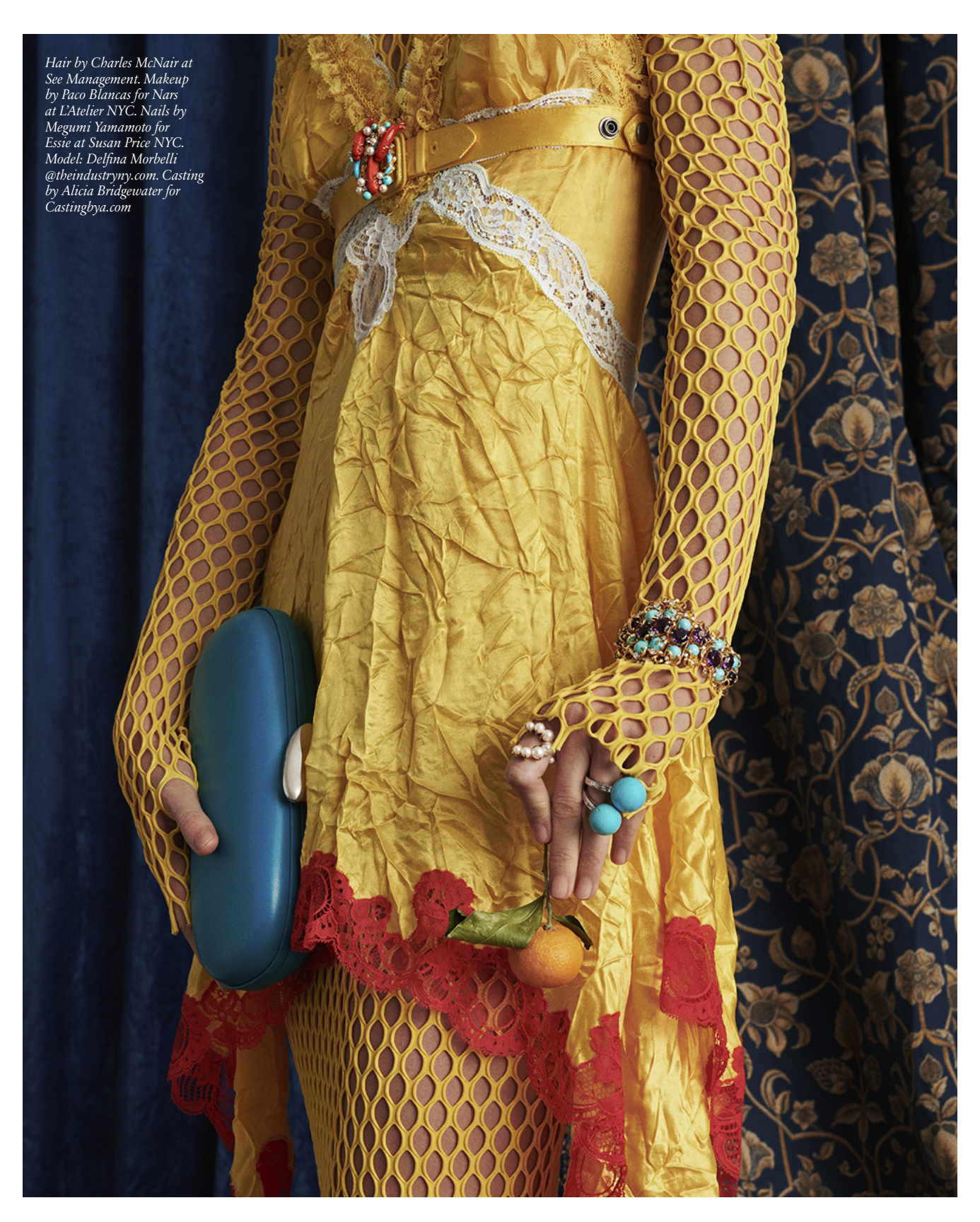
BURBERRY DRESS, SLIP, AND BRA; MICHAEL KORS COLLECTION MINAUDIERE ($1,550); SEAMAN SCHEPPS BROOCH ($19,450); MAHNAZ COLLECTION GEORGE WEIL BRACELET; ANA KHOURI RINGS ($26,800, SOLD AS PAIR). OPPOSITE: ERDEM TOP ($1,195) AND SKIRT; HANDSOME STOCKHOLM GLOVES ($140); STEPHEN DWECK NECKLACE ($2,745); BELPERRON CUFF ($28,500); ANTONIA MILETTO RING ($9,000); HERMES HANDBAG ($2,725). FOR DETAILS SEE PAGE 97